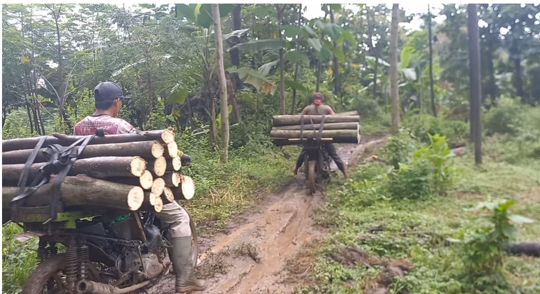
Fig. 1. Modified motorbike used for timber extraction in private forests in Probolinggo.

This research was conducted in a private forest partnership between the Bromo Mandiri Private Forest Cooperative and the wood processing industry in Probolinggo, East Java. The research site is located in Patalan Village, Wonomerto District, Probolinggo Regency, East Java. The research is located at an altitude of between 87 and 1,400 meters above sea level. The terrain conditions at the research location are flat (slope < 20%) and rather steep (slope > 20%) (KBM 2022). The private forests observed were monoculture private forests. The types of trees cultivated are sengon ( Falcataria moluccana ) and balsa ( Ochroma grandiflorum ). This private forest was cut using a clear-cutting system. The felled trees were bucked into short wood with a minimum diameter of 10 cm and a uniform length of 130 cm. The area of observed private forest was 0.02 ha. The distance for timber extraction was 300 m. The skidding path was 2 m wide and had a mostly flat slope. This path was muddy and slippery after the rainfall (Fig. 1). This research was carried out from January to March 2023.